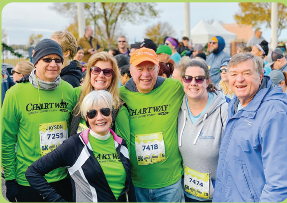
Board Members and Senior Leaders Participated in the Chartway Norfolk Harbor Race Weekend