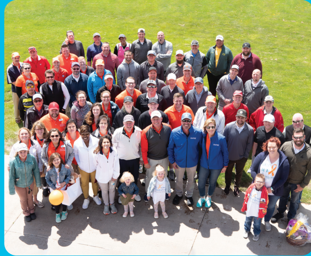
Board Members, Leaders, and Supporters at our We Promise Foundation's 4th Annual Putting 4 Promises Golf Tournament in Lehi, UT