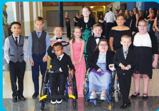
We Promise Heroes at our 14th Annual We Promise Foundation Gala