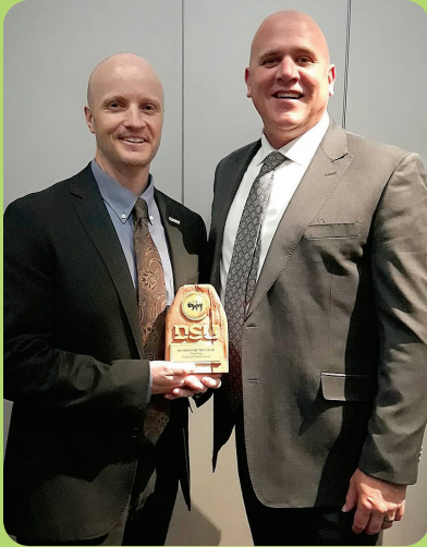
Chartway Proudly Accepted the Sponsor of the Year Award from Dixie State University