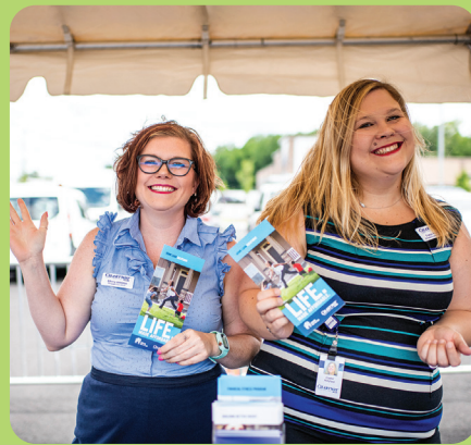
Team Members Making Life More Affordable in our Communities